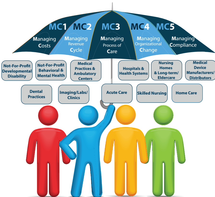
Four Pillars of Health Care

In response, Dopkins & Company has created MC5, a unique multi-disciplinary service offering designed to assist our clients manage FIVE related critical success factors: Cost, Revenue Cycle, the Process of Care, Organizational Change and Risk/Compliance.